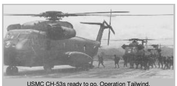
USMC CH-53s ready to go, Operation Tailwind.

At an emergency meeting in Bangkok, the CIA's senior war planner told the visiting Chief