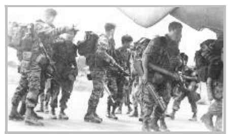
SOG's Company B "Hatchet Force" boards USMC helos at Dak To, South Vietnam, to raid deep into Laos.

The helicopter armada paralleled the remote border for 50 miles then turned west into the high mountains of Laos and almost immediately NVA gunners began